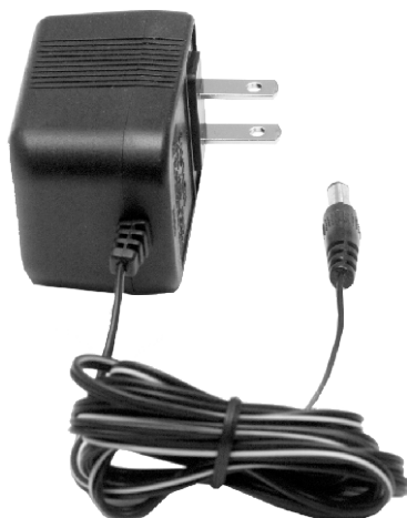
(Adapter) 115V: SP-115 230V: SP-230